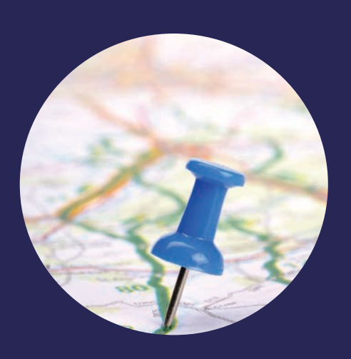
ASSIGN HOT SPOTS